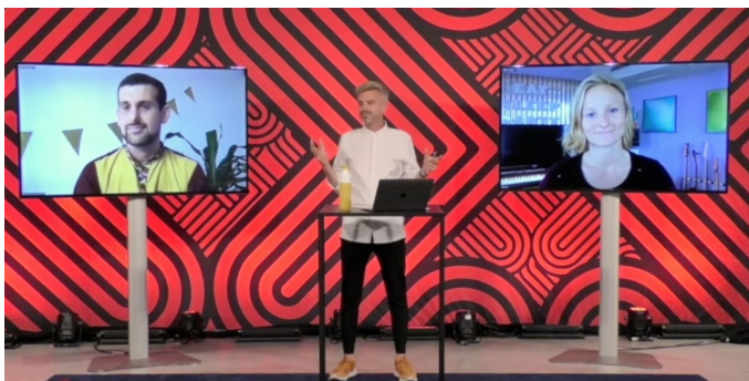
The Student Hotel's Team Retreat (2021)