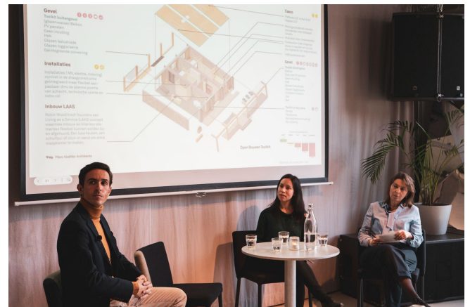
The Common Agenda for Shared Living (2021)