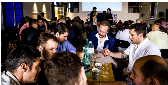
Co-Liv Summit (2018)