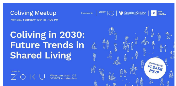
Coliving in 2030 (2020)