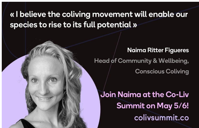
Co-Liv Summit (2021)

We speak at global conferences, facilitate interactive workshops and moderate and participate in industry panels.