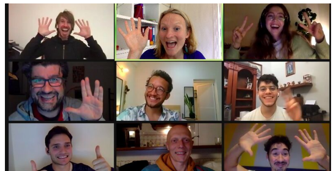
Community Facilitator Support Circles (2021)